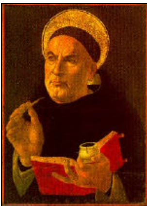
Thomas Aquinas Summa Theologica