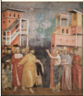
St. Francis' Renunciation and Sermon to the Birds

St. Francis adds the Franciscans to the Benedictines