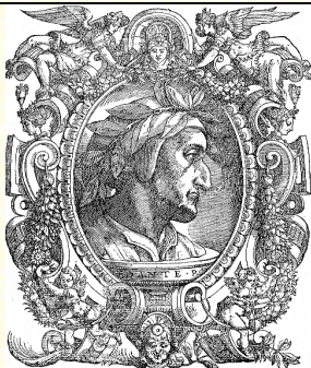
Dante (1265-1321) wrote his Comedy ...a journey from hell to heaven