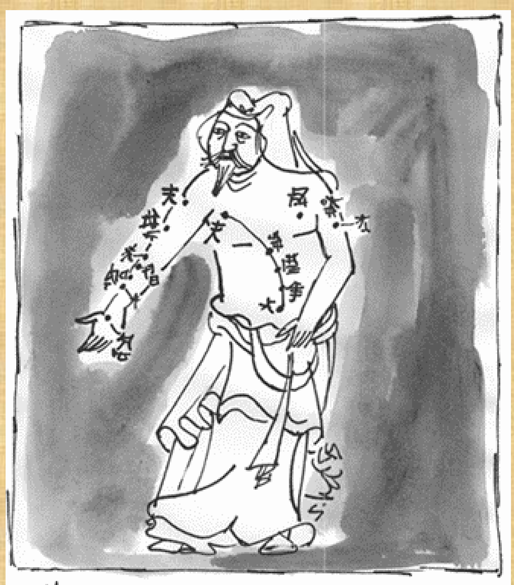
MING DYNASTY ACUPUNCTURE CHART (DISTRIBUTED BY MING DYNASTY BANDAGE CO.)