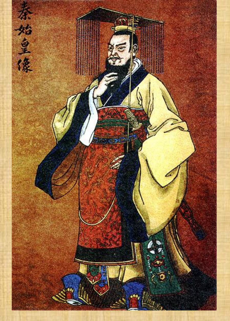
Figure 1: The First Emperor of China: Qinshi (221-210 B.C.).