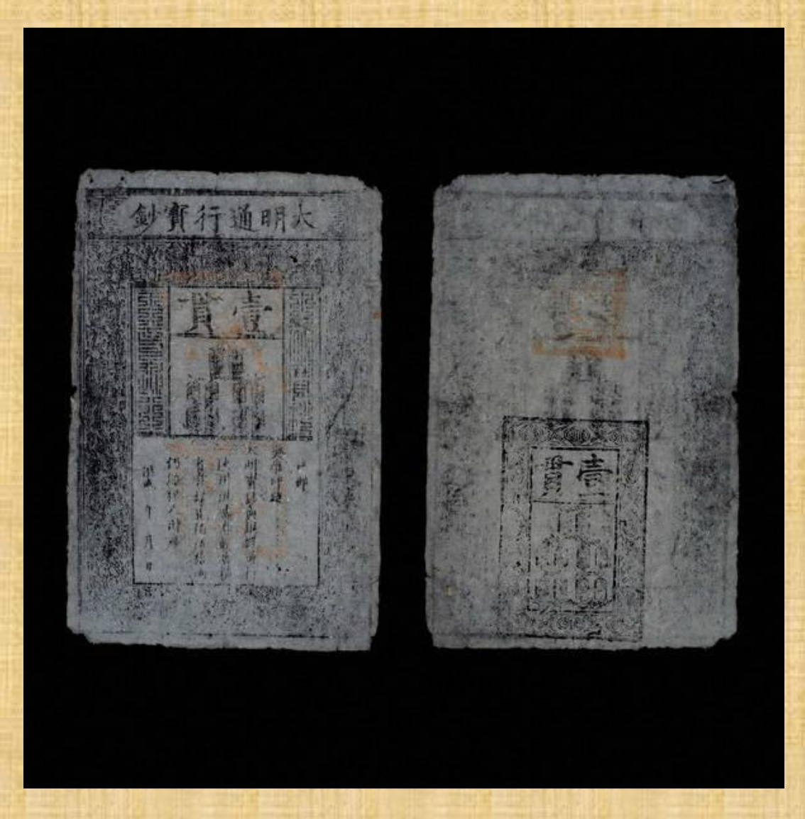
Early paper money