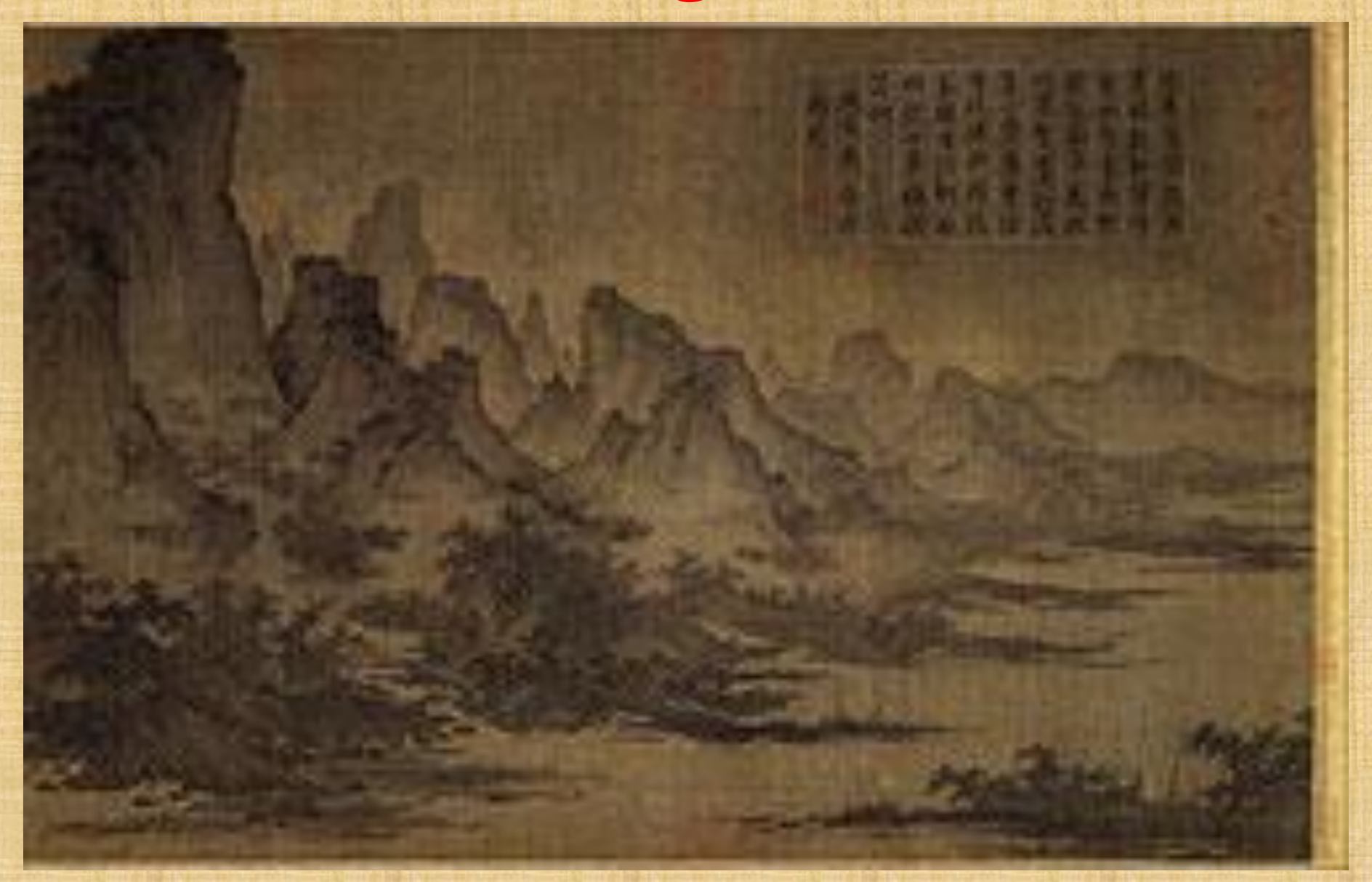
Summer Mountains from Northern Song