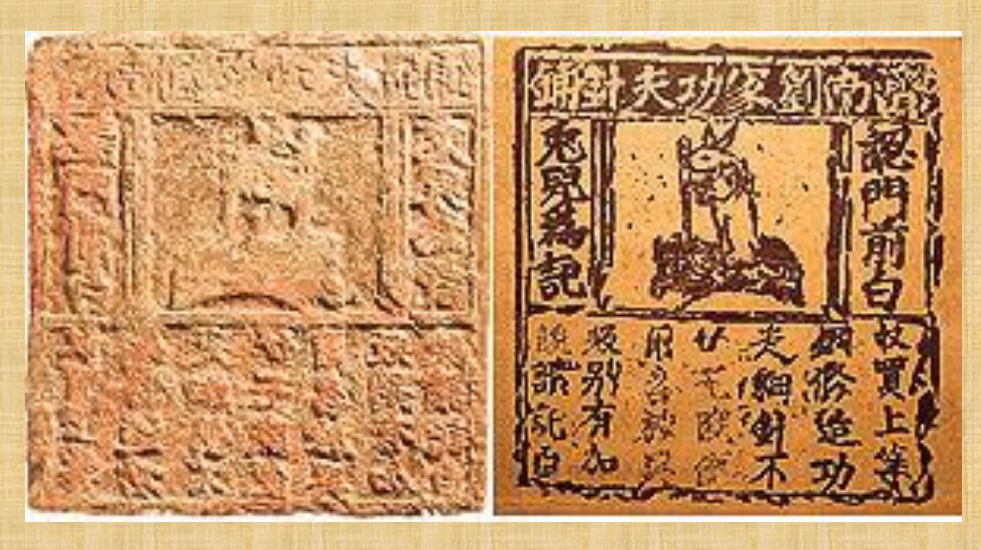
Lau's Kong Fu Needle Shop in Ji 'nan (this is the first advertisement made by rubbing on an engraved copper-plate)