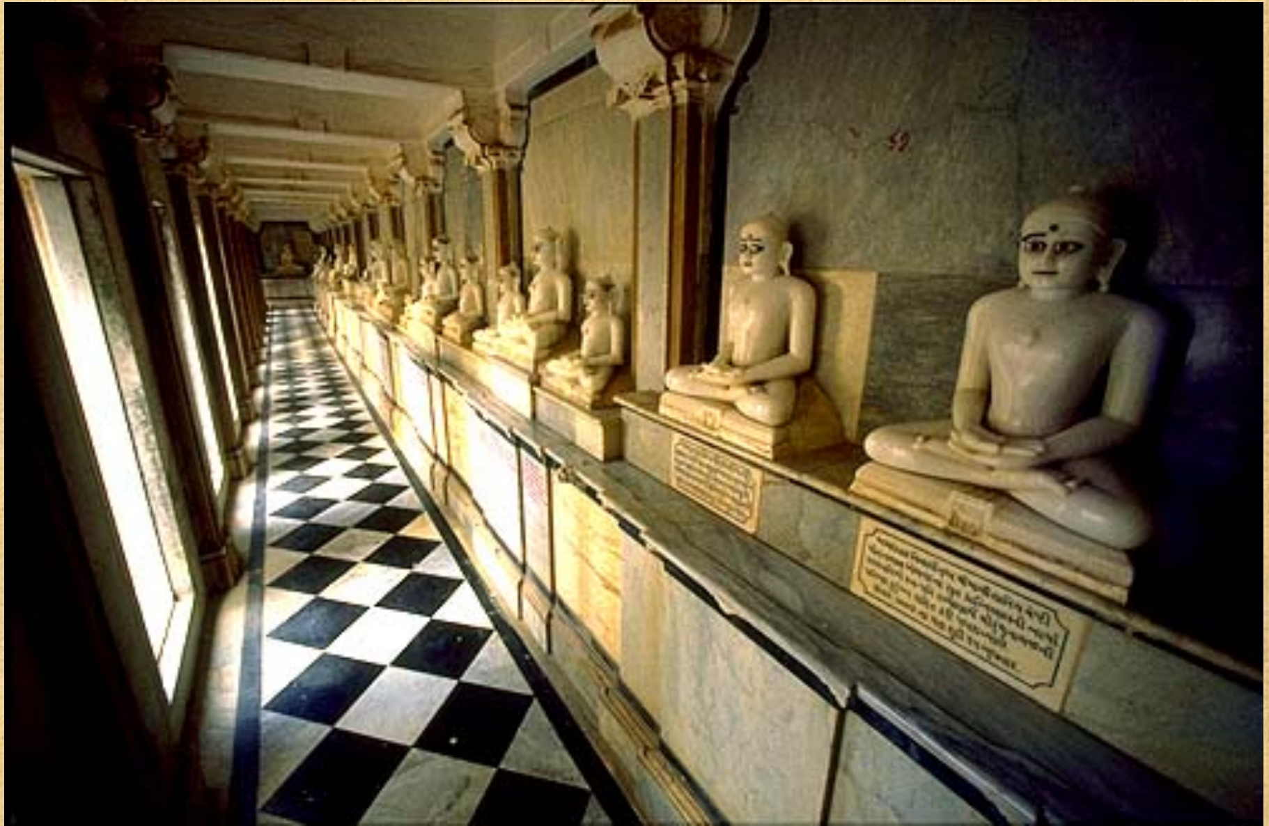
Tirthankaras—“ford builders” or “crossing builders”