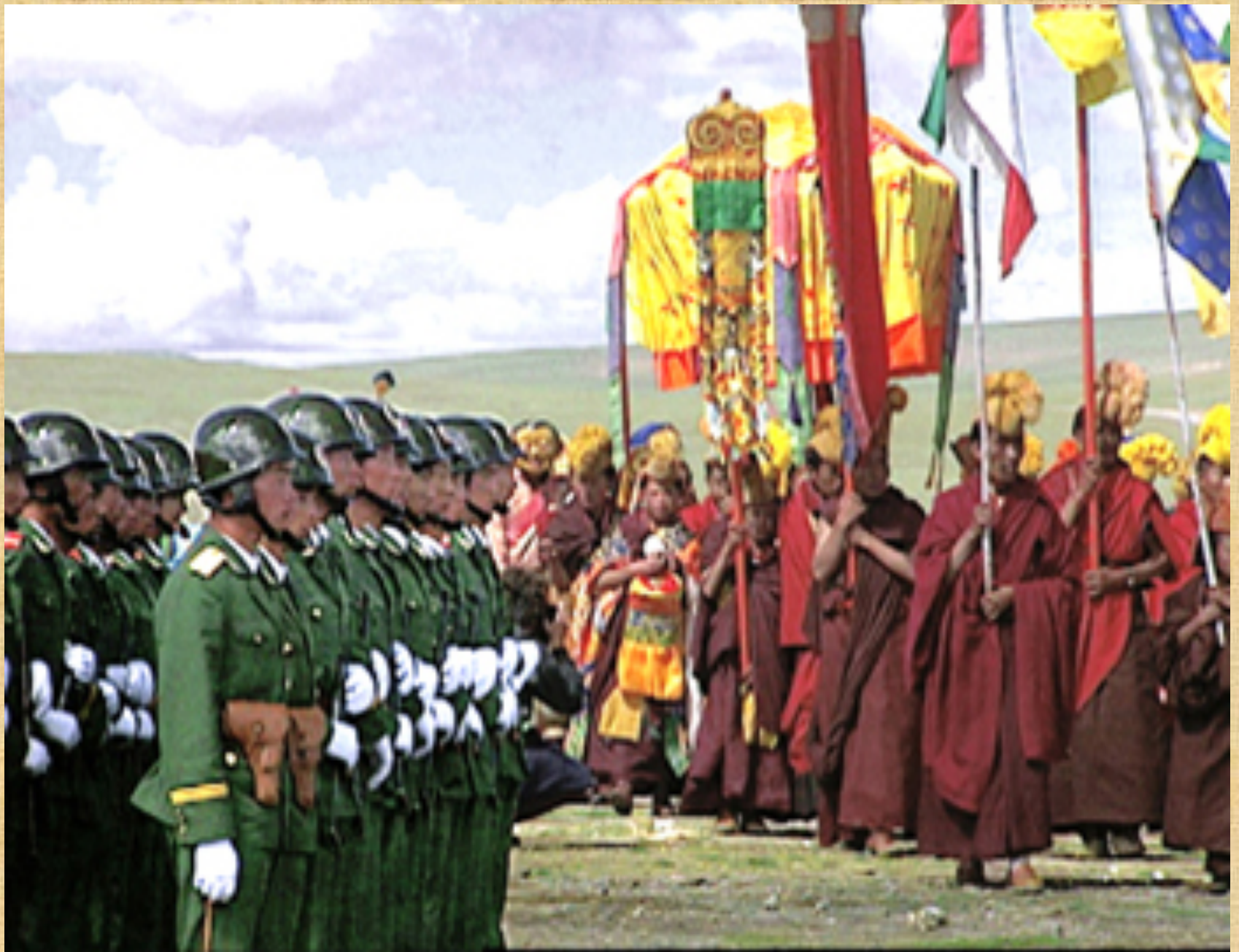
Chinese Army and Tibetan festival