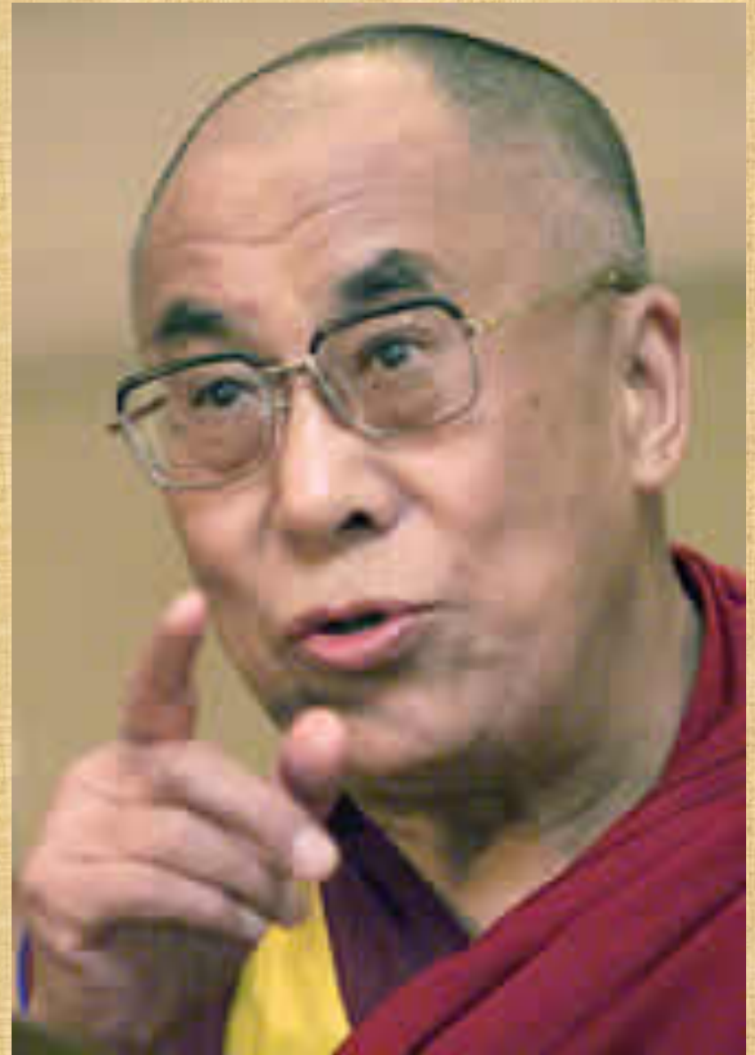
His Holiness, the Dalai Lama