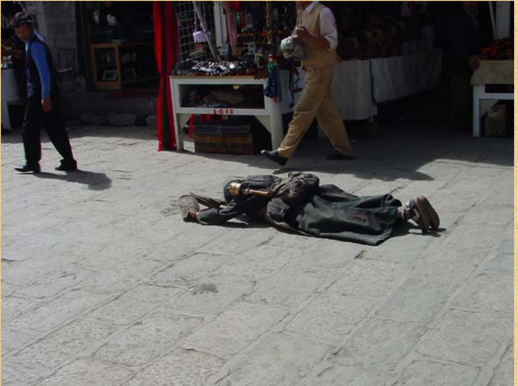
Buddhist prostrating himself