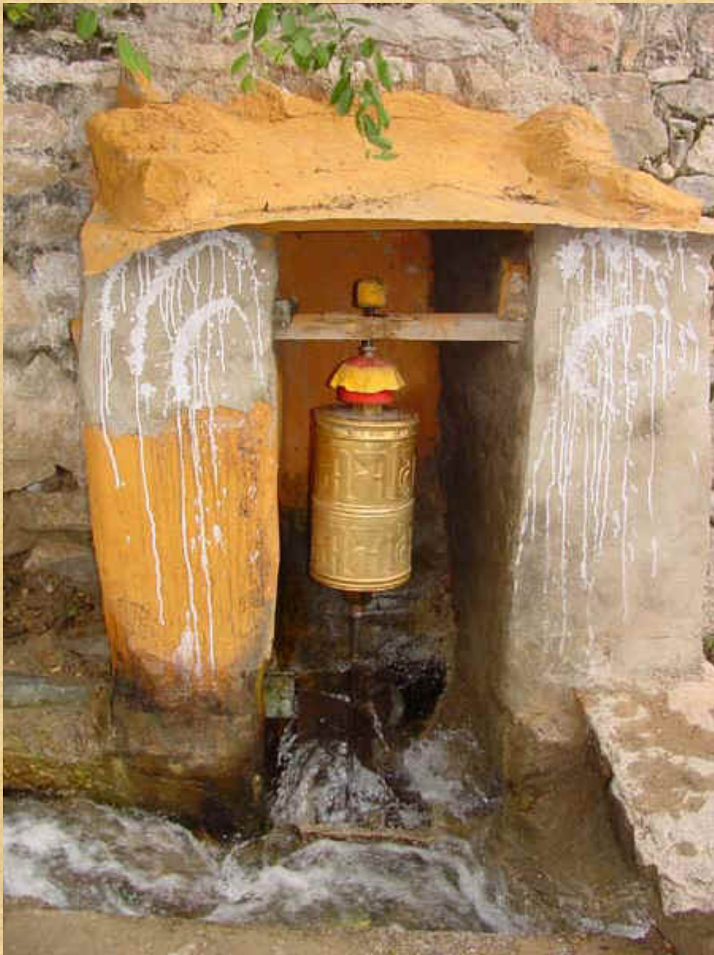
Water-powered Prayer Wheel