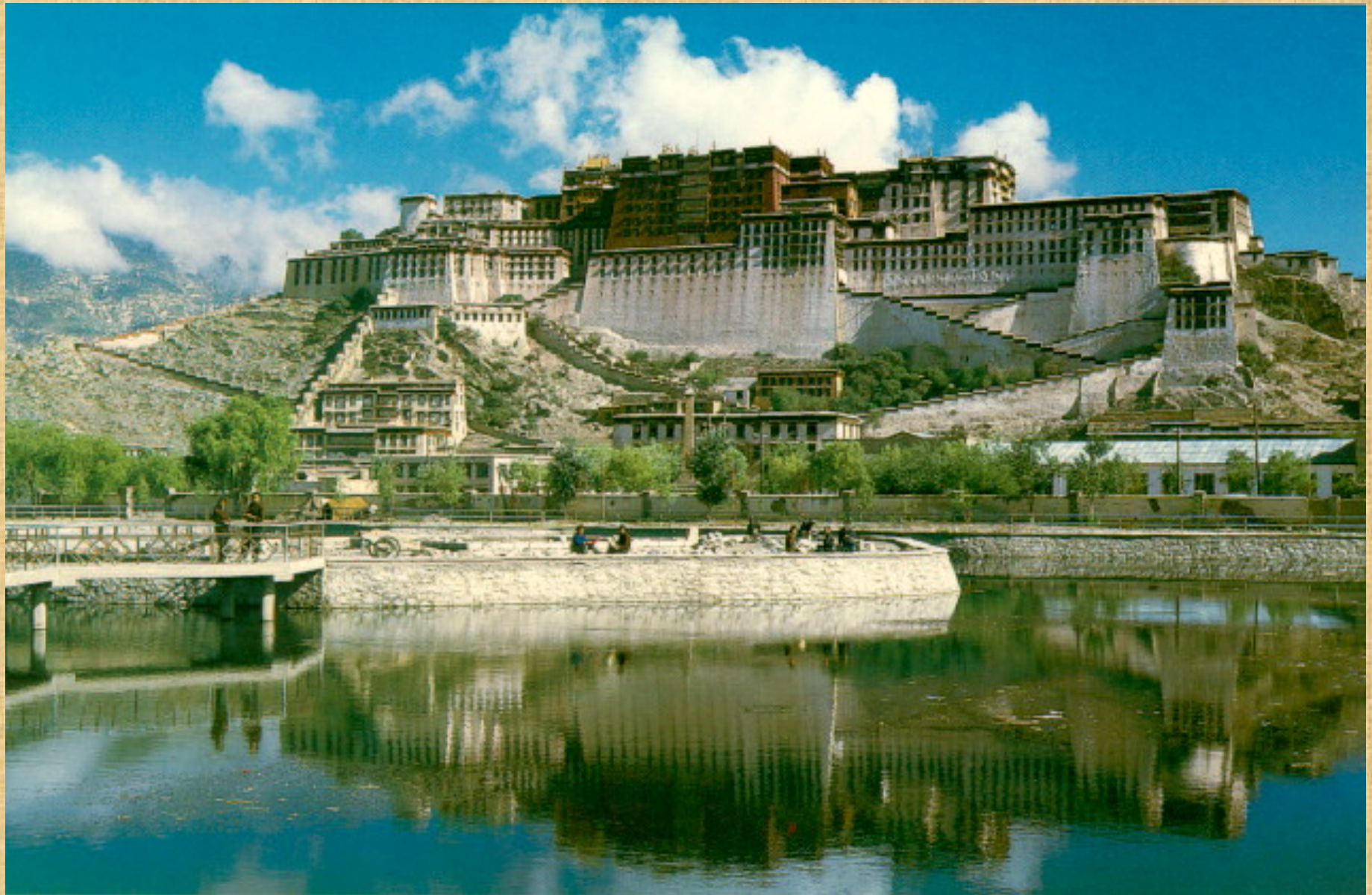
Potala, Lhasa, Tibet