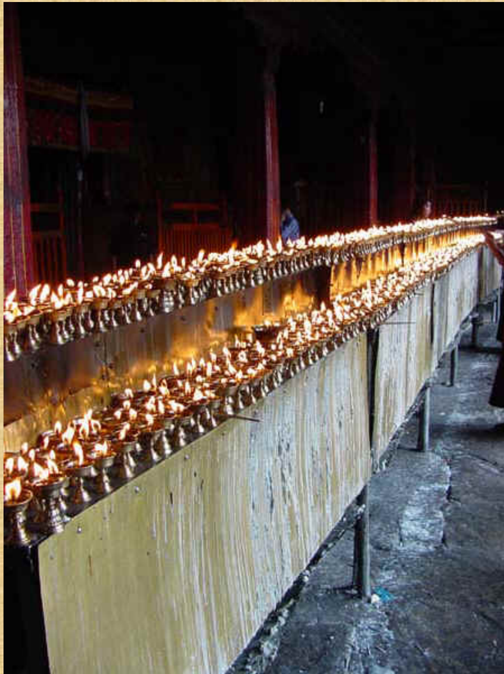
Yak candles at Jokhang Temple