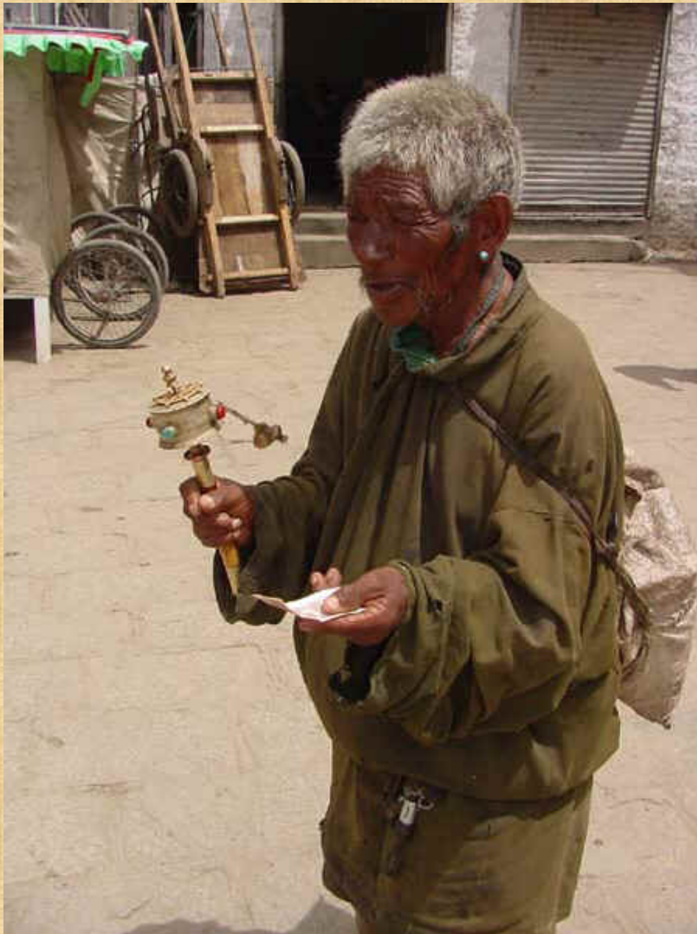
Hand-held Prayer Wheel