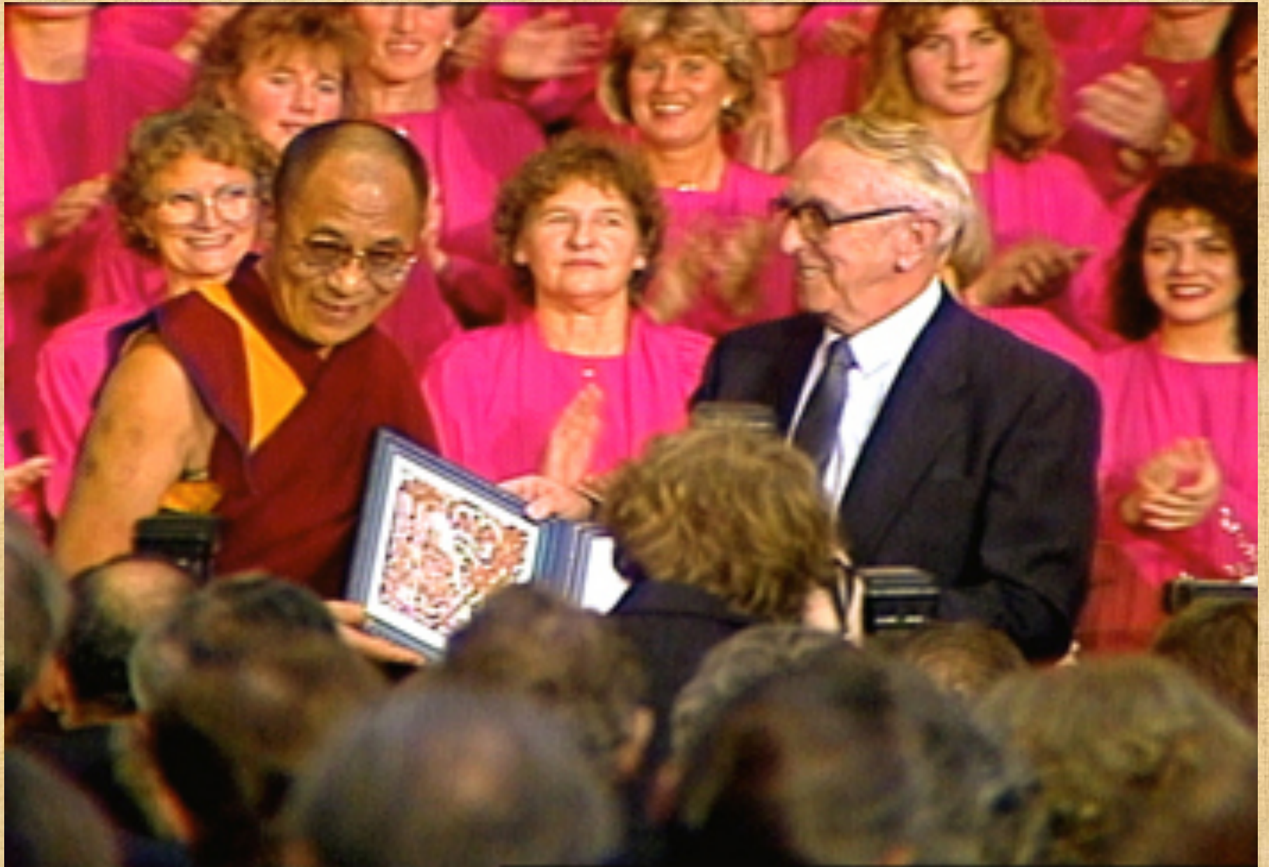
Nobel Peace Prize 1989